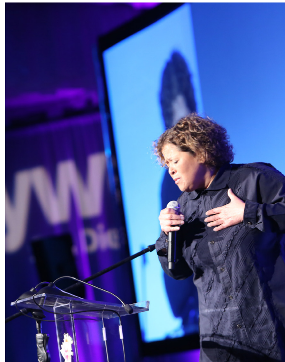
2016 keynote speaker: Anna Deavere Smith