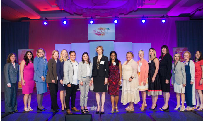
2016 Tribute to Women & Industry Honorees

The Tribute to Women & Industry Awards (TWIN) recognize women in a managerial, executive or leadership role for their outstanding achievements. TWIN honorees are inducted into a longstanding, prestigious group that has honored women since 1980. Three additional awards were established to provide another dimension of recognition for their tremendous impact throughout San Diego: