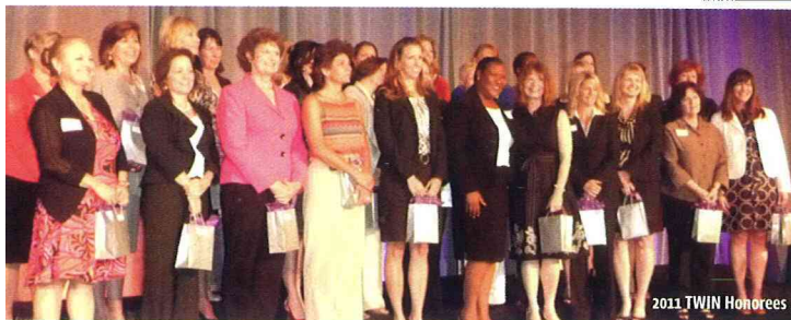
2011 TWIN Honorees